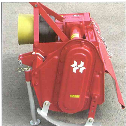
Chain side drive equipped with 1" chain.