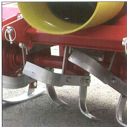
The rotor with blades 9941/42 is very effective.