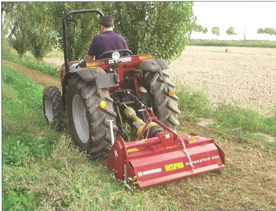
Rotavator 200-105. Specially designed for compact tractors.

Trailing board shape allows an even flow of soil and a level finish. Easy to adjust.